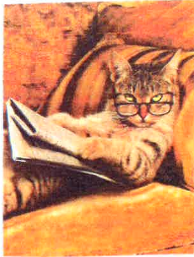
Stay inside and read the paper!