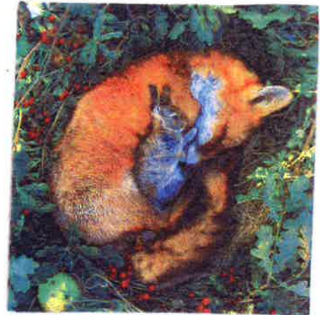
Take a long nap!